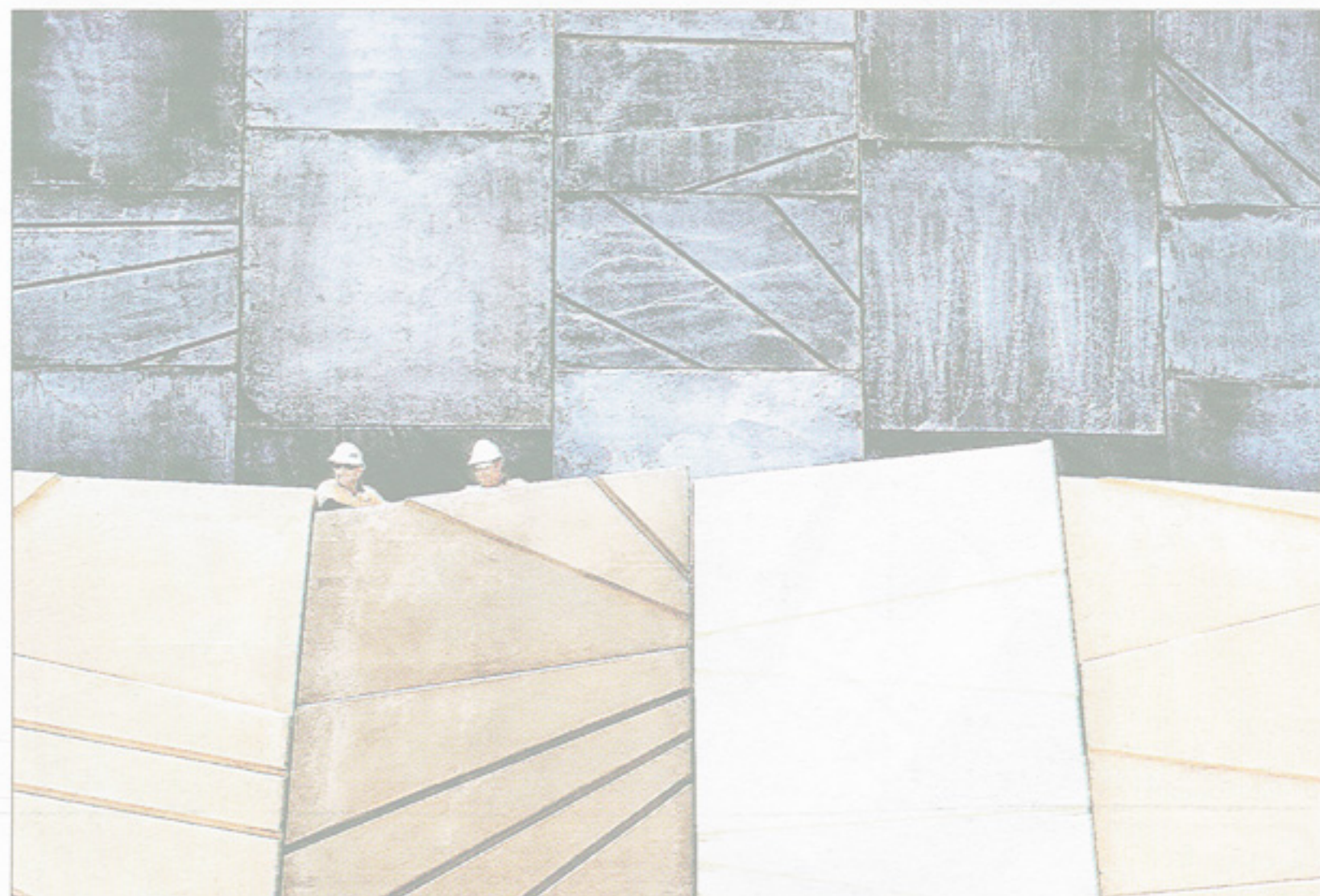
Rough beauty: A shot from the EastLink exhibition.